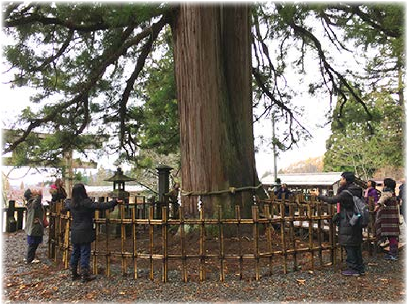
900 year-old cedar. Tree Love workshop, Togakushi, Japan