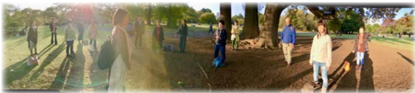
Tree Love workshop, Shinjuku Gyoen, Tokyo, Japan

Walking along a mossy forest path, I was met by a wave of love beyond anything I'd ever experienced. It was emanating from a magnificent and noble oak tree and the love was for me. Spontaneously, I burst into tears — of joy, of relief, of being met. That was the beginning of an ongoing journey that has taken me around the world. I have now spent 22 years communicating, healing, and joining in service with loving, intelligent, gorgeous trees in about 90 locations in 18 countries. This is my personal story but it is also the story of a sentient universe. If my heart's desire is fulfilled it can be a story of how we all come together to create a new thriving planet entering into its next stage of evolutionary progression.