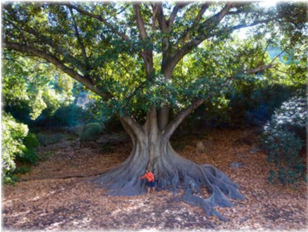
Spectacular loving Moreton Bay Fig in Perth, Australia, with Kriti

The information you will read here is astonishing — it is to me still — and for some of you will seem improbable. If so, I admire you for being willing to give it your attention at all. If this is all new to you, I just ask that you stay open to the possibility that there is much more going on than you may ever have considered. Check it out for yourself to whatever extent you are able or arrange sessions or workshops with me to learn the skills involved. Alternatively, you can read this as fiction or let it go as not for you.